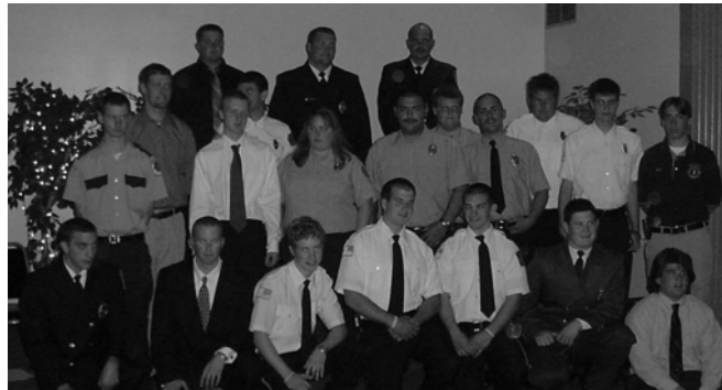
2005 Fire I graduating class poses for their graduation picture