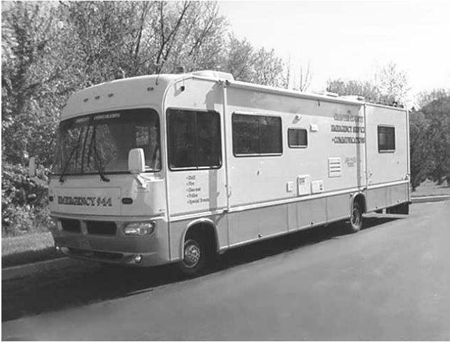
Outside view of Comm 1

Chester County's mobile communications unit, designated as Comm 1, is designed to support Emergency Responder Organizations with mobile communications. Comm 1 responds to emergencies at the request of any Police, Fire or Emergency Medical Service (EMS) agency to provide on site communications and command post capabilities. It has the capabilities to communicate with Chester County Police, Fire and EMS units, Amateur Radio Emergency Service/Radio Amateur Civil Emergency Service (ARES/RACES) volunteers, Pennsylvania State Police (PSP) and counties bordering Chester County.