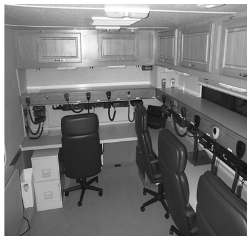
Inside view of Comm 1's radio room

If Comm 1 is needed to support and provide communications for a municipal or community function, please submit a Comm 1 Request Form to the Department of Emergency Services at least 60 day prior to your event. A request form can be found on our website, www.chesco.org/des ; look under forms.