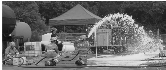
HMT member demonstrates the use of foam for vapor suppression

20 members of the Hazardous Materials Team were used as a pilot group and the first from the County to go through the written test and skills stations. Future Hazardous Materials Operations courses will offer the certifications test to the students.