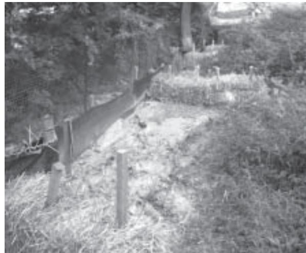
Silt fence installed down a hill, hay bales added to try to check flow, and failing rock filter at bottom of hill

There are many dynamics to a pipeline project, from the impacts on local landowners to the environmental impacts from construction that are felt well beyond the ROW. Dealing with a pipeline also involves working with a new agency, the Federal Energy Regulatory Commission (FERC). FERC approval is needed prior to beginning any of these pipeline projects, and they also provide construction oversight.