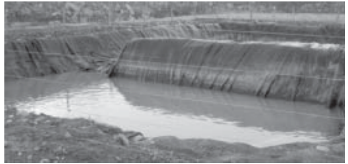
Holding pit for well drilling discharge prior to disposal off site.

In May 2009 the DRBC issued a determination effective immediately that requires commission approval for “ any natural gas extraction project located in the shale formations with the drainage area of Special Protection Waters,” which includes the 197 mile non-tidal Delaware River from Hancock, N.Y. to Trenton, N.J. In Pennsylvania this affects all or part of Bucks, Carbon, Lehigh, Monroe, Northampton, Pike, Schuylkill and Wayne counties. The Marcellus shale does not occur in all of these counties, but other shale formations do. The DRBC has advised at least one potential applicant of a natural gas extraction project in the Lockatong Formation in Bucks County that its project will be subject to DRBC review. The DRBC is going to propose new regulations concerning