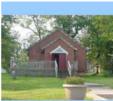
Hosanna AUMP Church (1843)