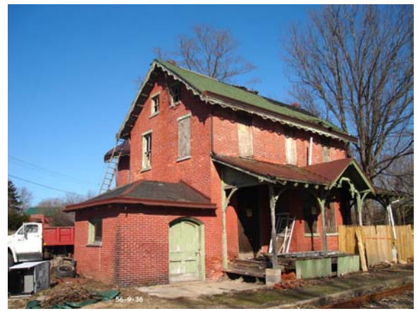
Lincoln University Railroad Station (1880)