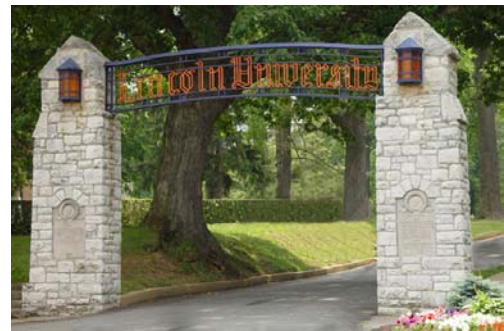
Lincoln University Arch