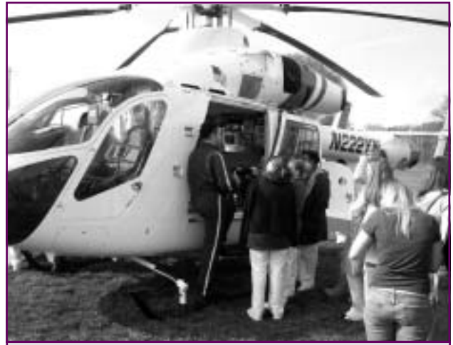
Brandywine Hospital's Sky FlightCare helicopter.

The day's main event included an appearance by Brandywine Hospital's Sky FlightCare helicopter. After landing safely at the event, the Sky FlightCare crew provided individuals with an overview of their role during trauma and emergency situations. Those that were fortunate to participate also had the opportunity to ask questions regarding education and career pathways for becoming a Flight Nurse and/or Pilot of the Sky FlightCare team.