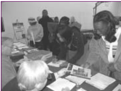
Participants registered for informational workshops and prizes.